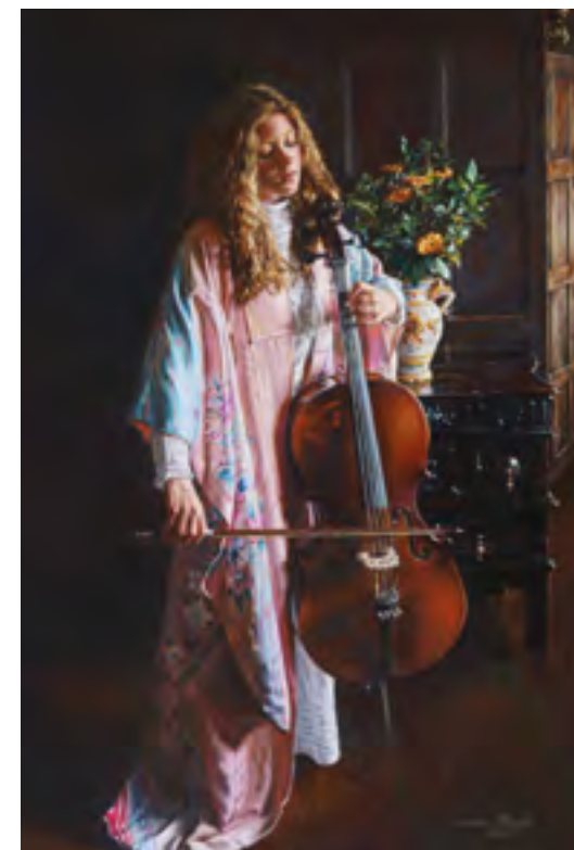
Sonatina 24 x 30 Gabiella 19 x 28