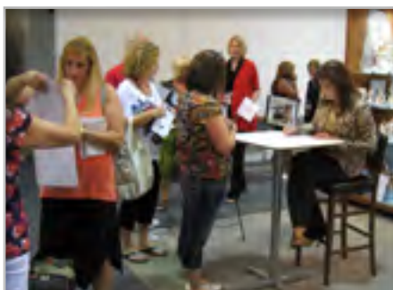
At an autograph session

You are cordially invited to the Opening Ceremony of