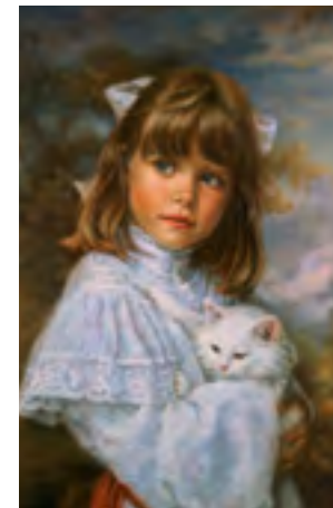
Girl with Kitty