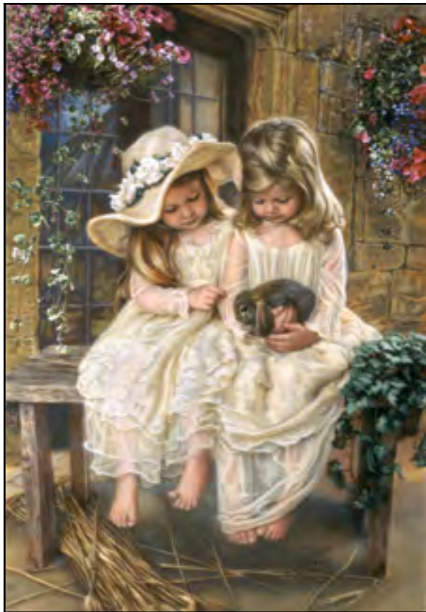
Helping Hand 30x40 ▶ Best Friends 24x30 ▶