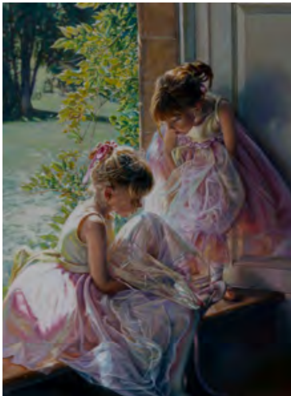
God's Gift 20 x 24 Before the Dance 24 x 30