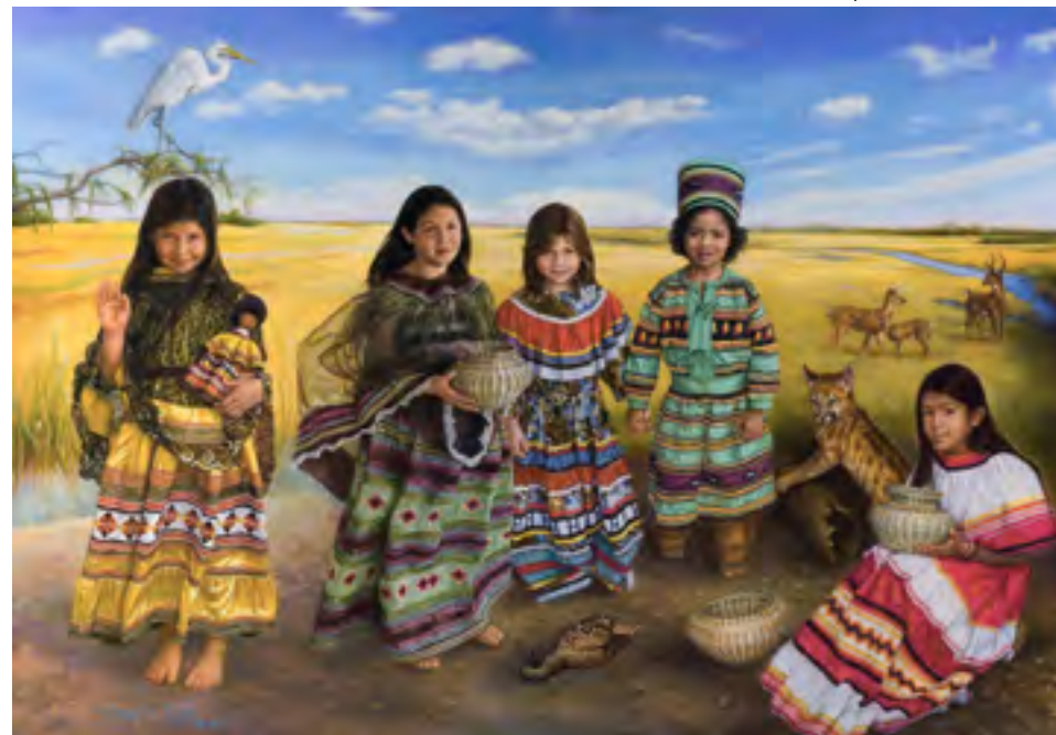
Seminole Tribe (Collection of Museum of Arts, South Florida)