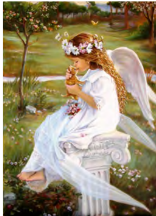
◀ Kissing Kitty 20 x 28 ▶ Cupid 24 x 30