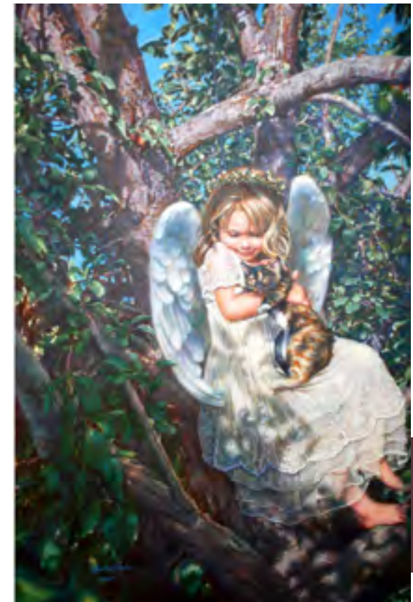
English Garden 30 x 36 ▲ Rescued 24 x 30 ▶