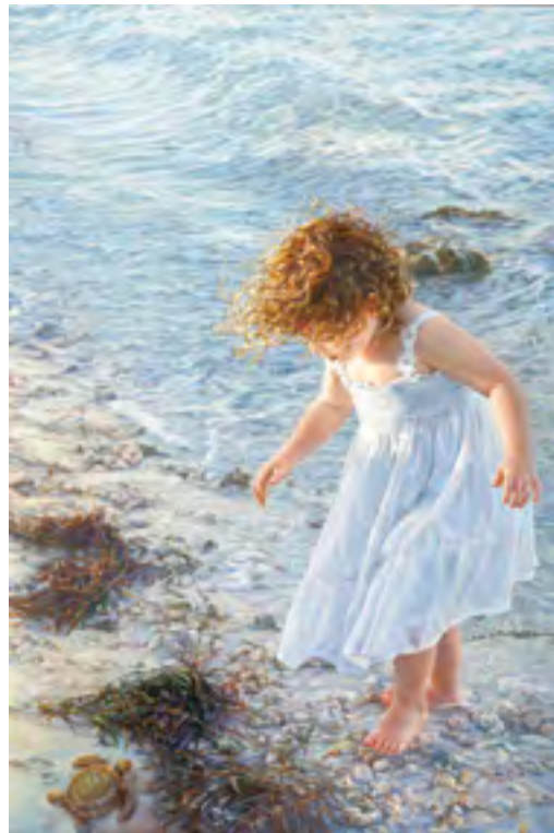
Exploring 24 x 36 Night Before Christmas 16 x 20